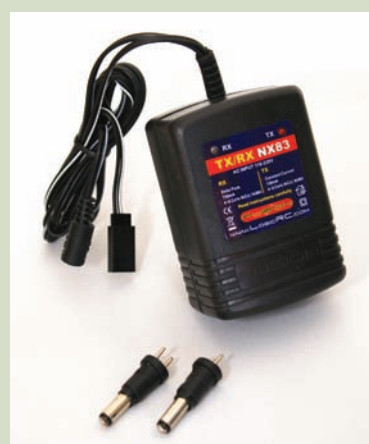
Left: Fusion NX83 AC only Tx/Rx charger is a standard replacement for most manufacturers' chargers