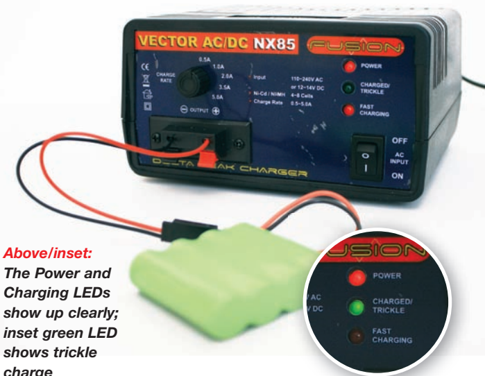
Above/inset: The Power and Charging LEDs show up clearly; inset green LED shows trickle charge

Contacts Logic RC www.logicrc.com 01992 558226