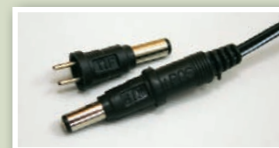
Above: Align the Power Plug 'TIP' pin to the required polarity, -NEG, or +POS as shown